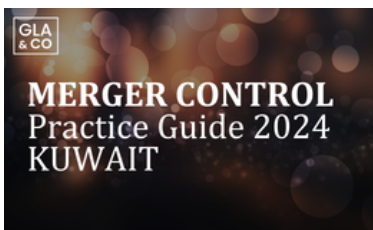
Merger Control - Kuwait