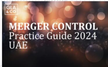
Merger Control - UAE