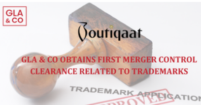
GLA & Co Obtains First Merger Control Clearance Related to Trademarks