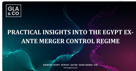
PRACTICAL INSIGHTS INTO THE EGYPT EX-ANTE MERGER CONTROL REGIME