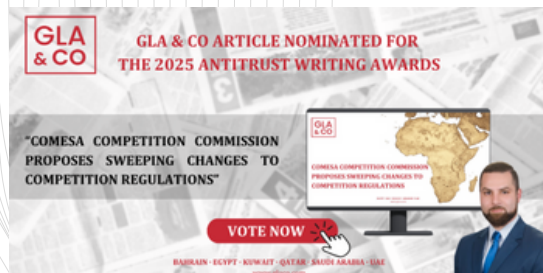
GLA & Co has been nominated for the 2025 Antitrust Writing Awards