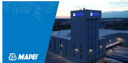
GLA & Co Acts as Local Counsel to Italian Company, Mapei S.p.A., on Acquisition of Saudi-based Bitumat