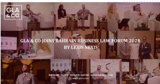
GLA & Co Joins Bahrain Business Law Forum 2024 by Lexis Nexis