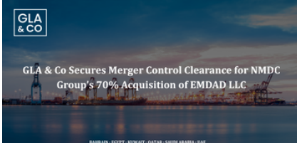
GLA & Co Secures Merger Control Clearance for NMDC Group's 70% Acquisition of EMDAD LLC