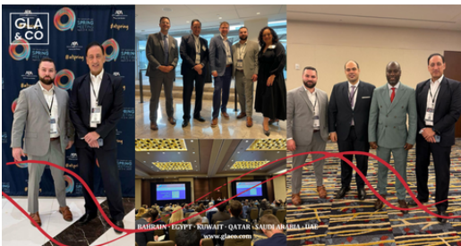
GLA & Co attended the 73rd Annual ABA Antitrust Law Spring Meeting in Washington, D.C