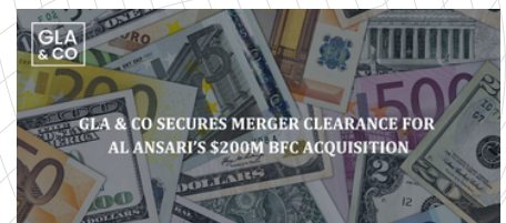
GLA & Co Secures Merger Control Clearance for Al Ansari Financial Services' $200 Million Acquisition of BFC Financial Services Group