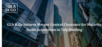
GLA & Co Secures Merger Control Clearance for Majority Stake Acquisition in Taly Holding