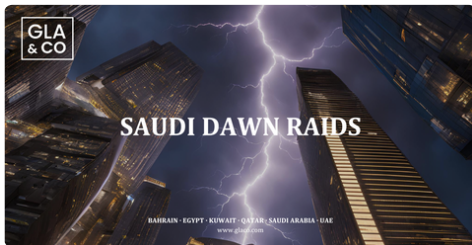
LESSONS LEARNED: SAUDI DAWN RAIDS