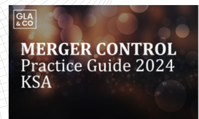
Merger Control - KSA