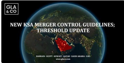
NEW KSA MERGER CONTROL GUIDELINES; THRESHOLD UPDATE