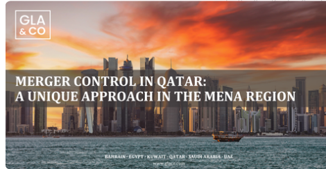
MERGER CONTROL IN QATAR: A UNIQUE APPROACH IN THE MENA REGION