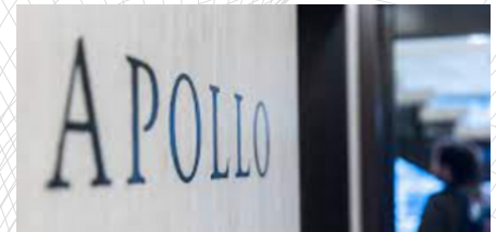
GLA & Co Secures Regional Merger Control Clearance on £ 1.23 Billion Deal