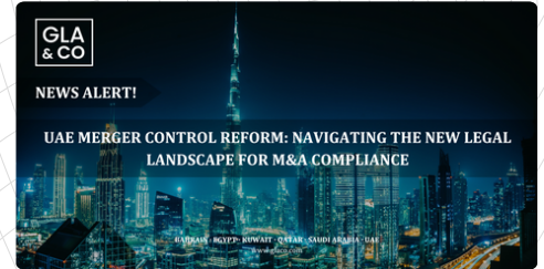
UAE MERGER CONTROL REFORM: NAVIGATING THE NEW LEGAL LANDSCAPE FOR M&A COMPLIANCE