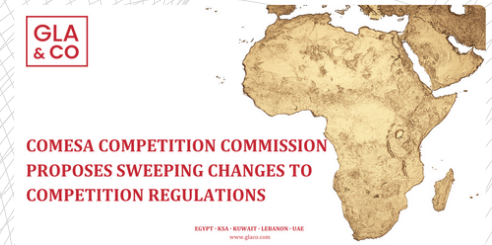
COMESA COMPETITION COMMISSION PROPOSES CHANGES TO COMPETITION REGULATIONS