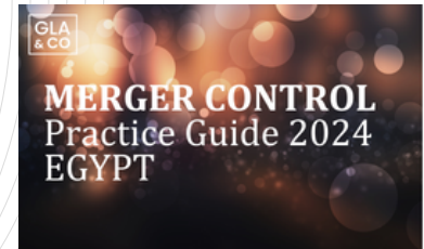
Merger Control - Egypt